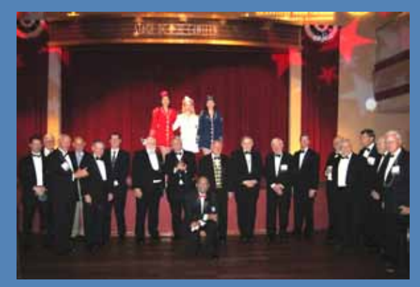
Past Presidents of the SESAUA gather at the annual banquet in New Orleans, LA

Following the success of the annual meeting in New Orleans, plans have begun for the SESAUA to return to New Orleans every 6 years.